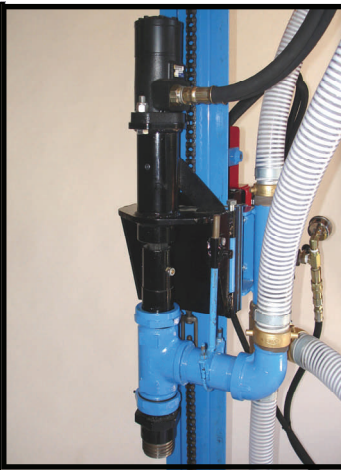
Rotary & Swivel