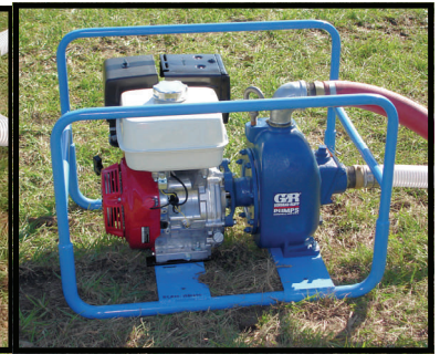
LS300H Mud Pump