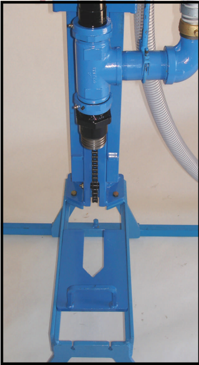
Swivel and Table Base