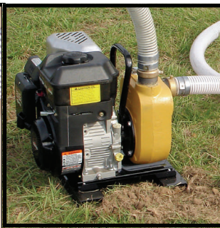
LS200H Mud Pump