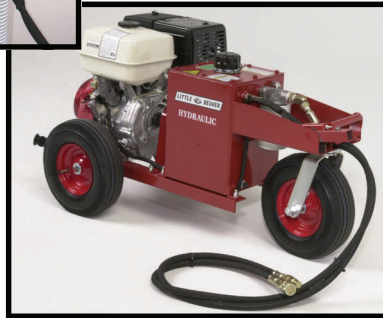
Hydraulic Power Unit (Gas)