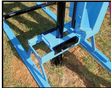
Re-enforced Table Base w/Slip