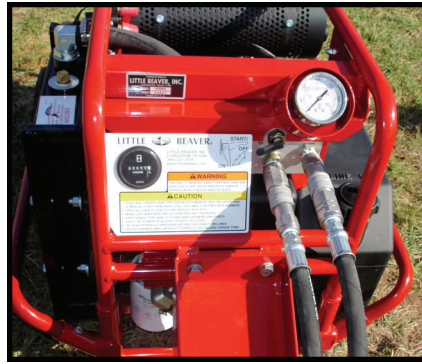
Hydraulic Power Unit (Gas)