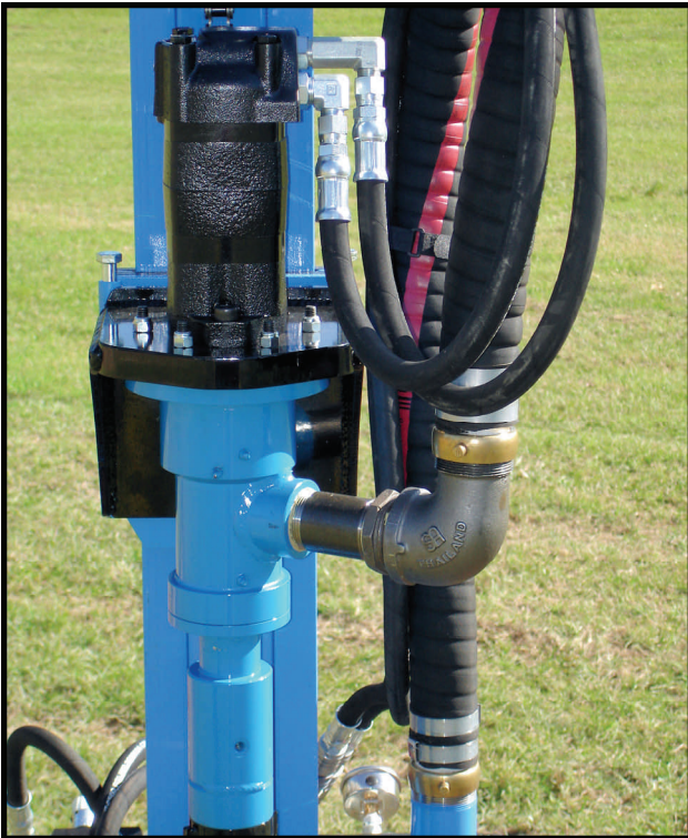
Hydraulic Rotary with Load Bearing Swivel