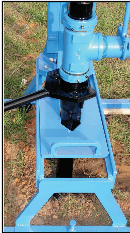
Swivel & Table Base