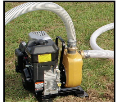
5HP Mud Pump