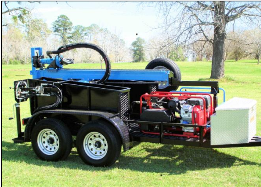
Mast Folds for Travel; Tongue mounted box provides safe storage for tools & accessories