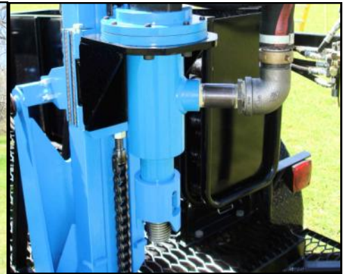
Swivel with J-latch breakout tool